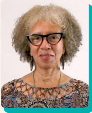
Carole Boston Weatherford Award-winning author